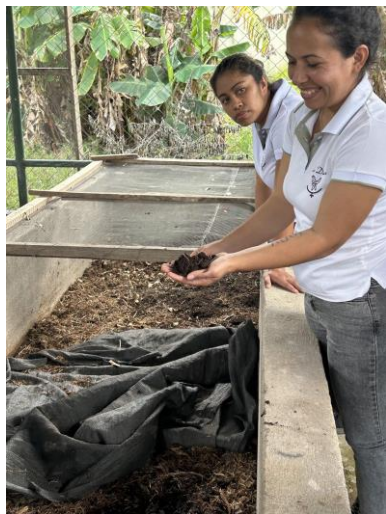
Las Diosas Coop