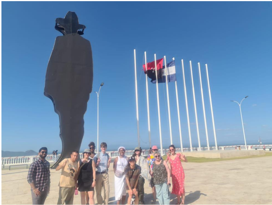
Augusto C. Sandino