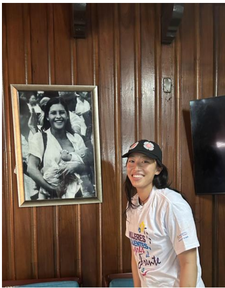
Ministry of Women, Hospital Occidental